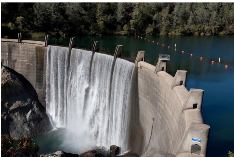
[Dams in California – Public Policy Institute California https://www.ppic.org/publication/dams-in-california/ ]

What about the water high up in dams? Does that have energy?