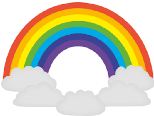
[Clean Public Domain. Many thanks.]

These pictures are very beautiful. But it is sometimes hard to see all the separate colours – so, let's look at a drawing.